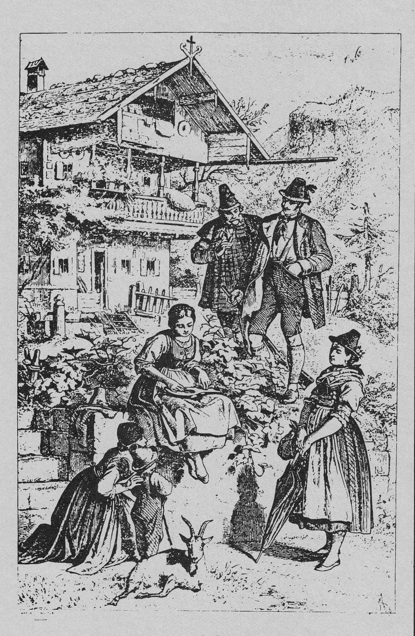
Title page "Collection of Exquisite Mountain Songs" by Ulrich Halbreiter dedicated to Duke Maximillian of Bavaria see page 3)